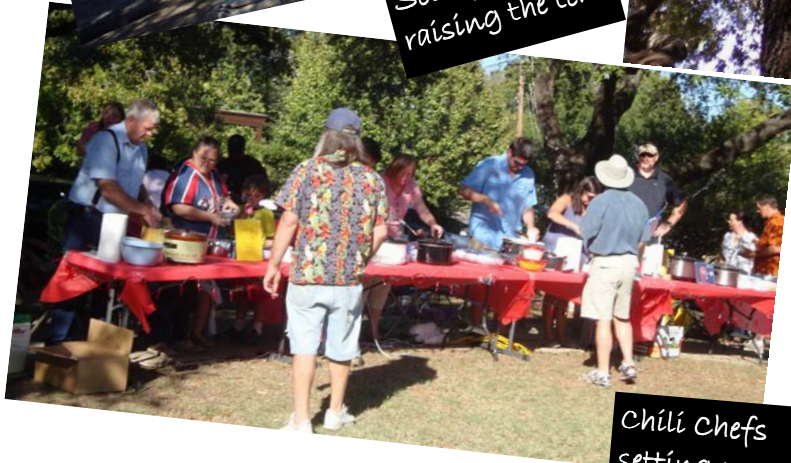
Chili Chefs setting up