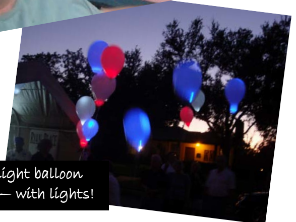
Twilight balloon lift — with lights!