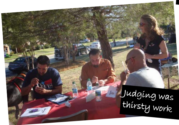
Judging was thirsty work