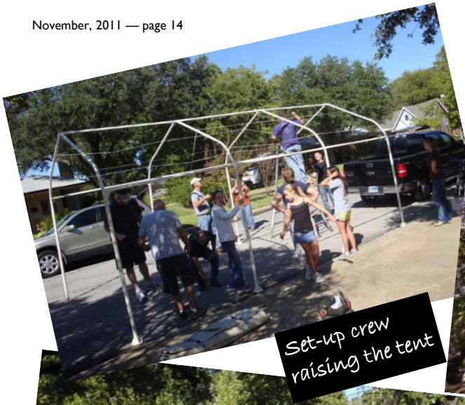
Set-up crew raising the tent