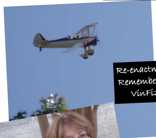
Re-enactment: Remember the VinFiz!