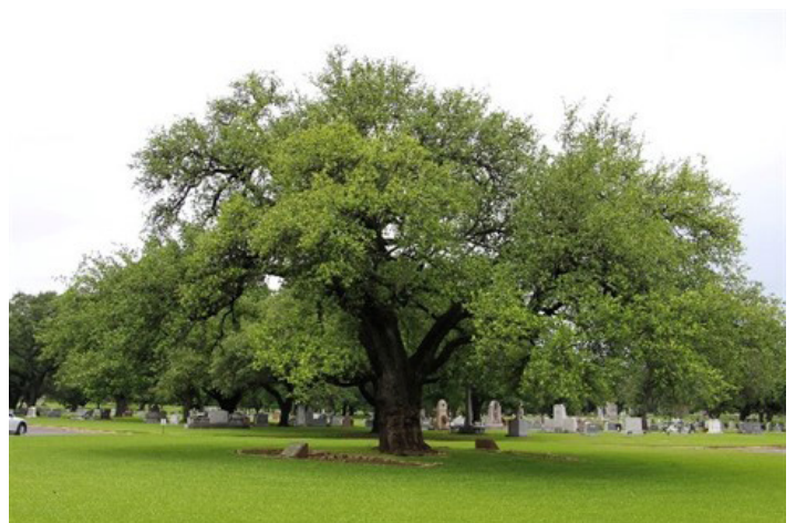
Photo: Located in Greenwood Cemetery, the 250-year-old Turner live oak has played an important part Fort Worth's history.

To learn more about the Heritage Trees program, email hannah.johnson@fortworthtexas.gov .