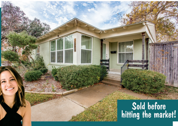
Sold before hitting the market!

“ Being a realtor in my own neighborhood for the last 11 years makes me feel like I've been working from home! With the housing market changing so fast lately, know you can lean on me for all your real estate needs because this neighborhood is my home and my heart. ”