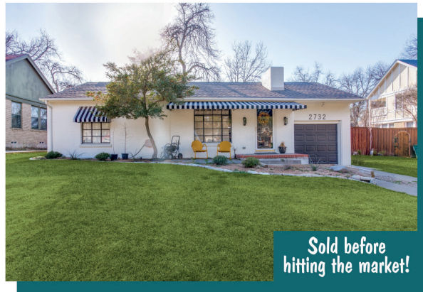
Sold before hitting the market!