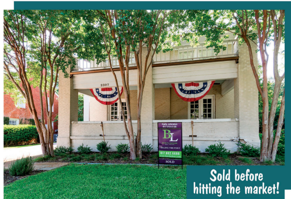
Sold before hitting the market!

“ Being a realtor in my own neighborhood for the last 11 years makes me feel like I've been working from home! With the housing market changing so fast lately, know you can lean on me for all your real estate needs because this neighborhood is my home and my heart. ”