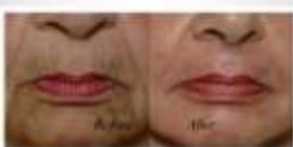
Chemical Peel $45 - $95