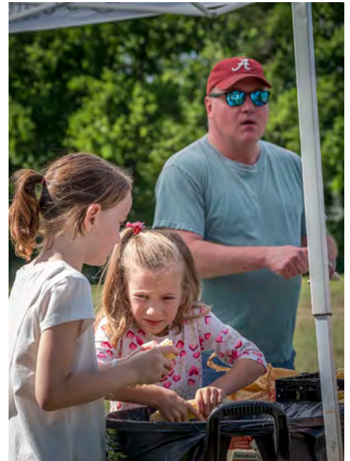
End of summer review: May 2018 Crawfish Boil